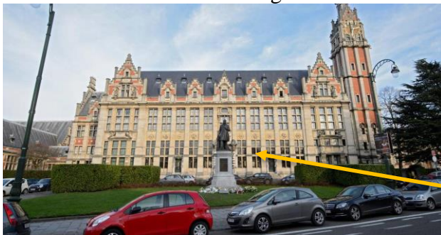
The entrance door